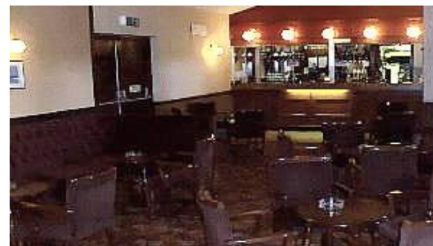
Elbow Suite Bar and Seating Area

Hire Rate (Guide Price): Friday Eve; £140, Saturday Eve £160 (Contact the office for more details or see website).